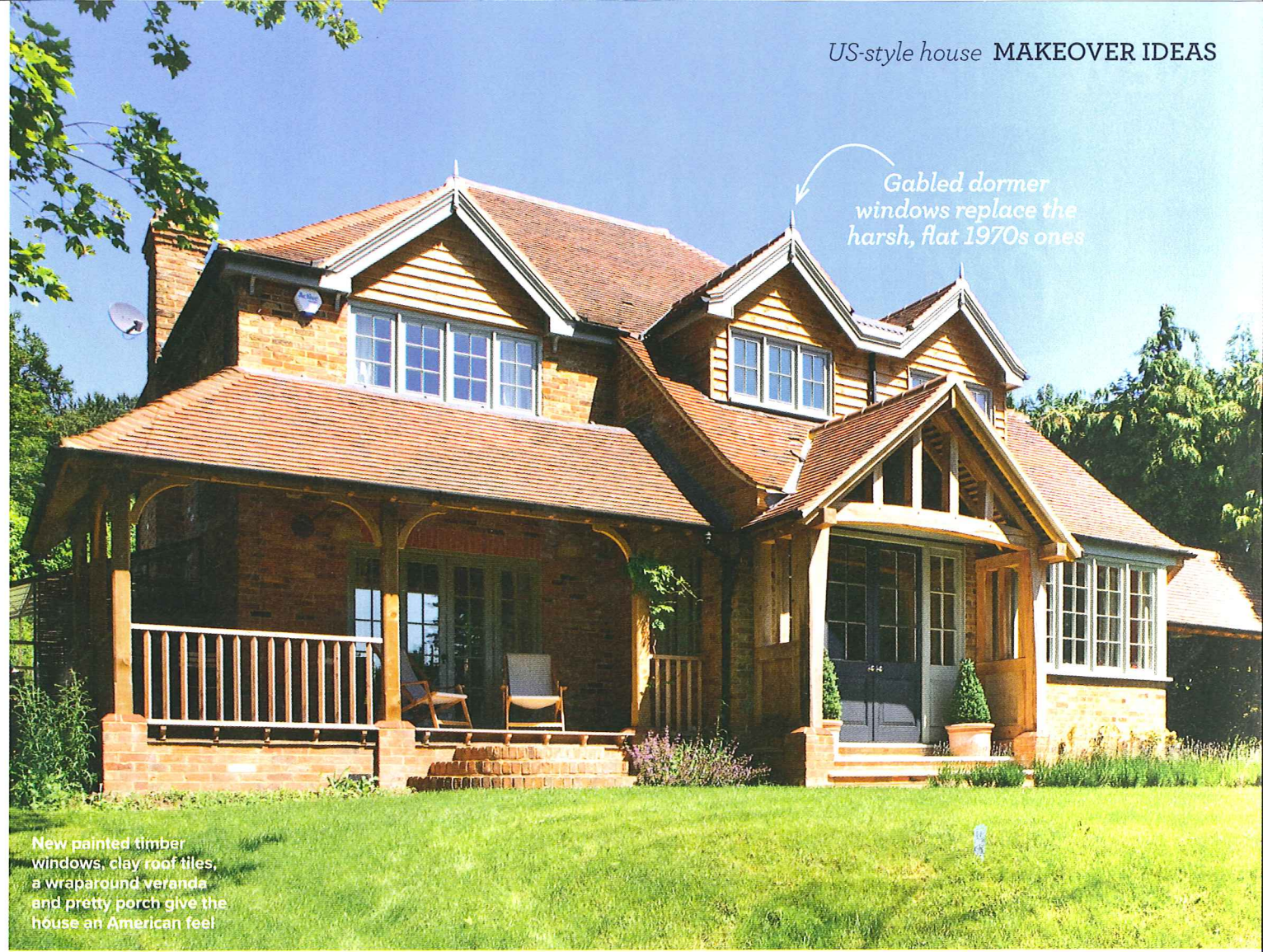
Gabled dormer windows replace the harsh, flat 1970s ones