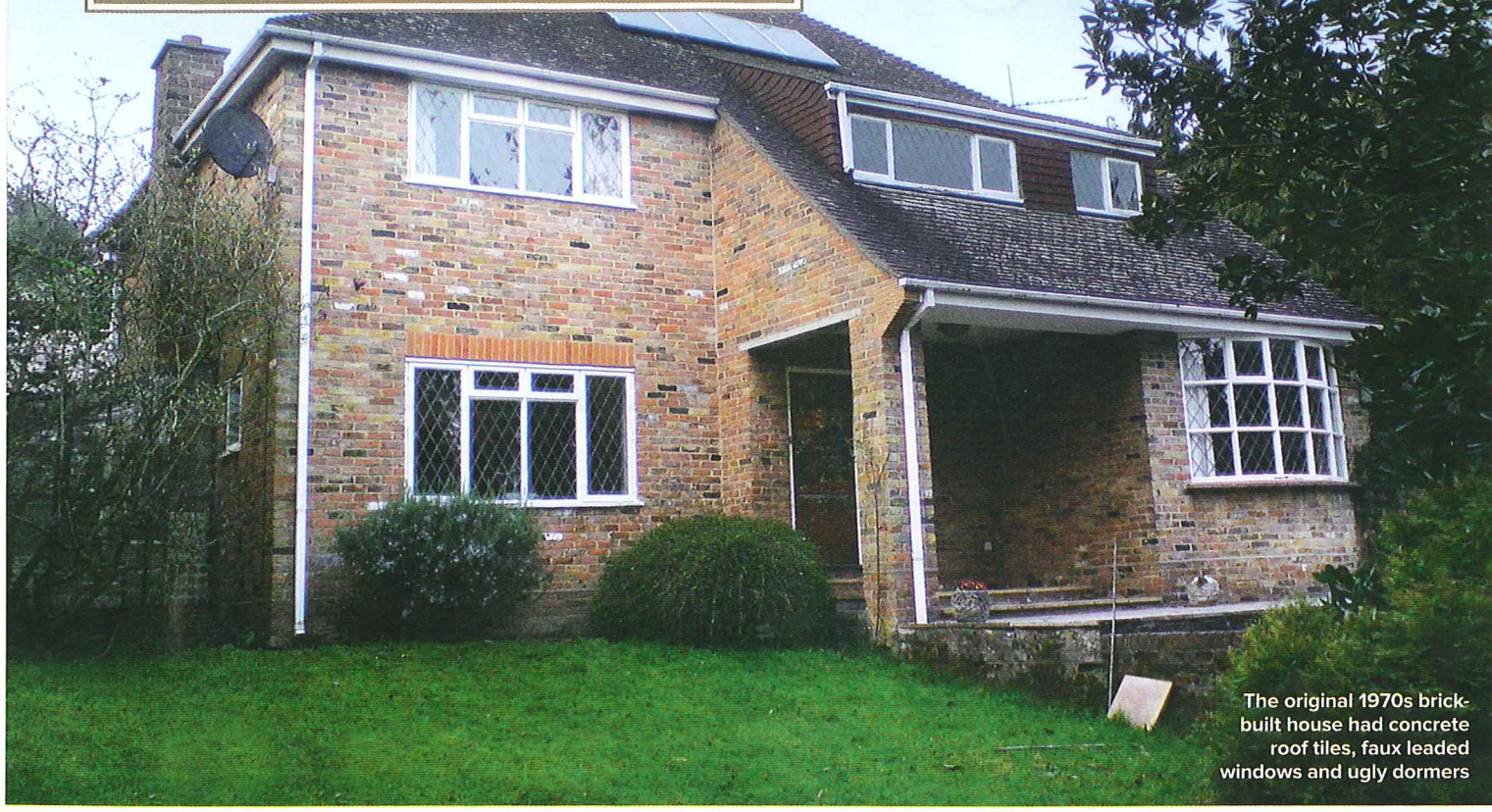
The original 1970s brick-built house had concrete roof tiles, faux leaded windows and ugly dormers